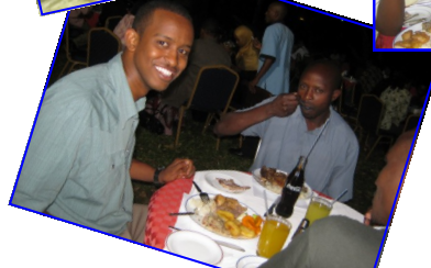
Dinner time for the participants at one of the Beach Hotels in Mombasa