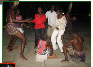
<< How about a jig at the Giriama Village?