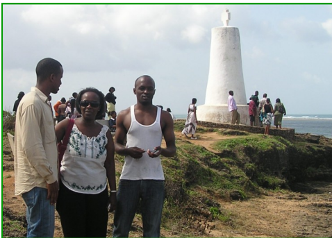
<< Participants at the Vasco Da Gama Pillar in Malindi.