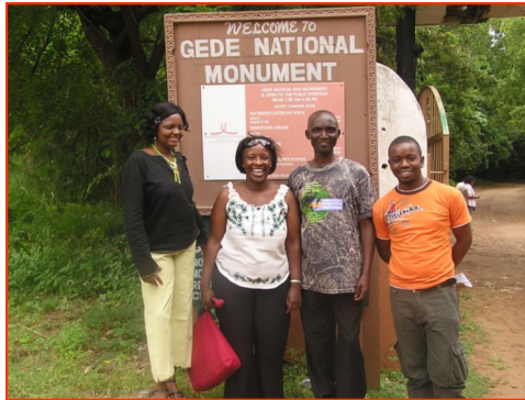
A visit to Gede >> Ruins was quite an exciting experience.