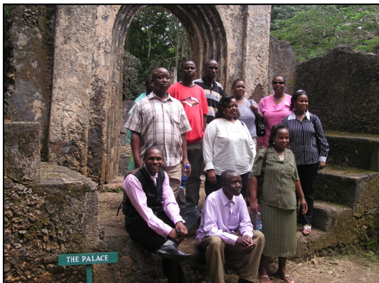
Participants learning more about the Historical Timeline at Gede Ruins - Malindi

The course attracted a large number of participants due to the complexity of Customer Care and Front Office Management functions. In the marketing circles, “the customer is always right” and the face value of the organization exists at its front office. In the view of these sentiments, how can an organization keep its customers satisfied and wanting more?