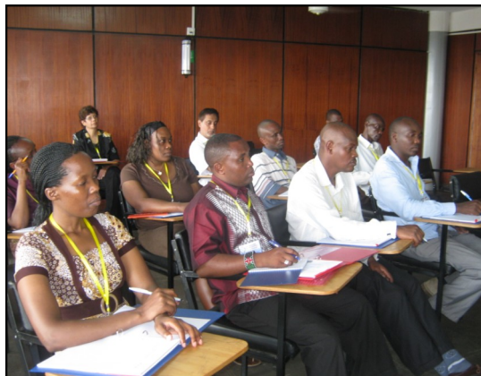
Trainees keenly following a lecture during one of the sessions

Computers have revolutionized the way we communicate and conduct business. How can an organization make sure its private data and the computer networks are well protected from malicious intrusion , illegitimate replication of private data and the security threats?