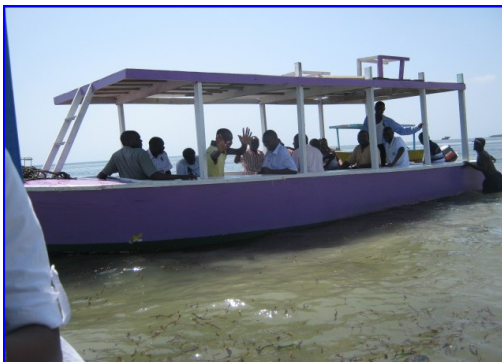
Participants >> enroute to one of the Indian Ocean Islands.