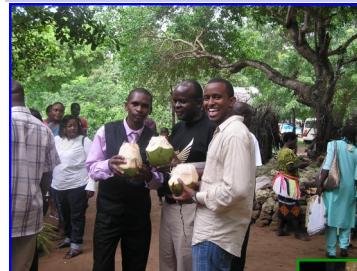
<< Our Administrator enjoying Madafu with some of the participants.